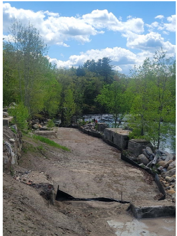
Woods Woolen Mill Site Day